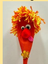
Wooden Spoon Prize 2024

£910.62 was raised for Fitzharrys School: a new Quiz record!