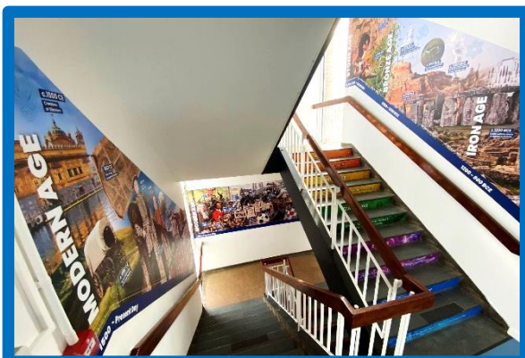
Fitzharrys' FSA-funded phase 1 wall art – Humanities Dept staircase